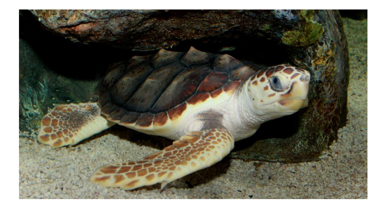
Clockwise: Hawksbill turtle, Olive ridley turtle, Green turtle, Loggerhead Sea Turtle (Wikimedia commons), Leatherback turtle (Dakshin foundation)